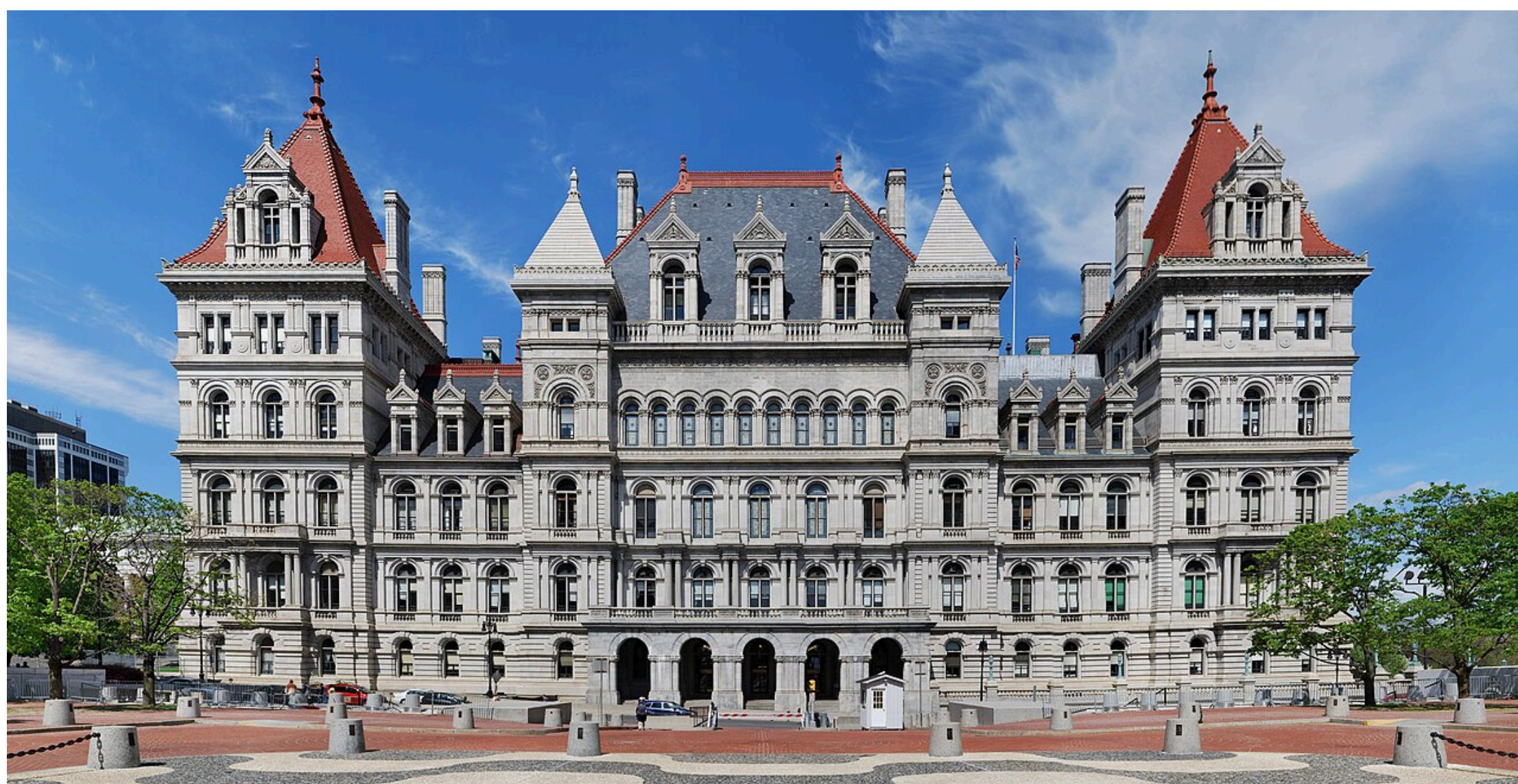
Photo credit: New York State Legislature by Matt H. Wade, courtesy of Wikimedia Commons